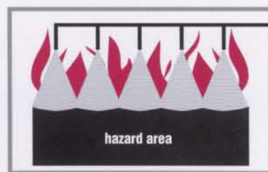
the competition: more hardware, less effective coverage.